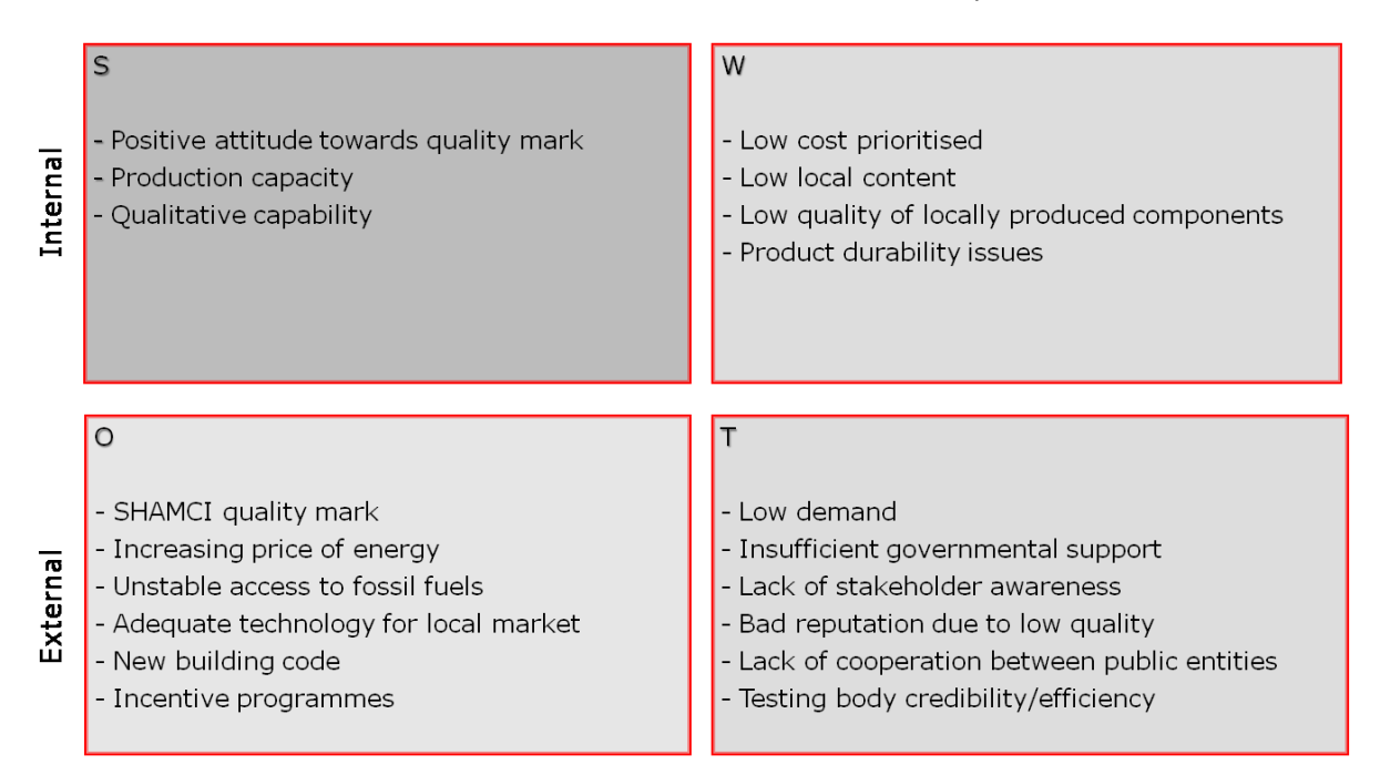
SWOT Analysis of the Egyptian Solar Water Heater Market

Suppliers expressed concerns about a possible exclusion of Solar Keymark on the local market.