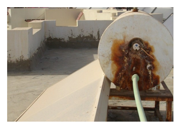
Corrosion of solar water heater tank

technologies. There was ambiguous information regarding a government initiative by the Ministry of Housing, Utilities and Urban Development to enforce the use of SWHs in new residential developments. Such regulatory schemes were widely welcomed by the industry as they were deemed to stimulate the market and create demand.