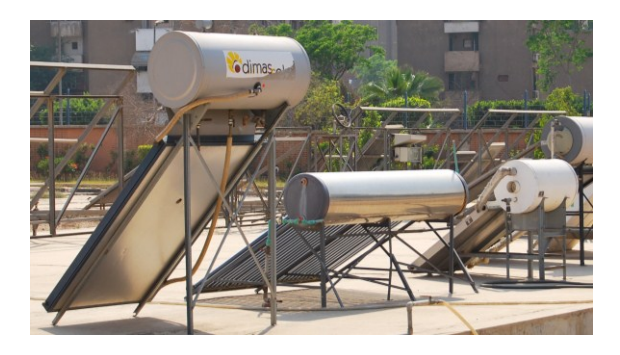
Flatplate & evacuated tube SWHs (thermosyphon)

system. In a closed loop system, the heated medium fluid passes through a heat exchanger that transfers the heat energy over to tap water inside a storage tank, while the medium returns into the collector. In an open system, the tap water is the medium that is passed through the collector and stored in the tank.