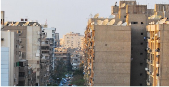
Current building design with satellite dishes

tives for customers was expressed. The price