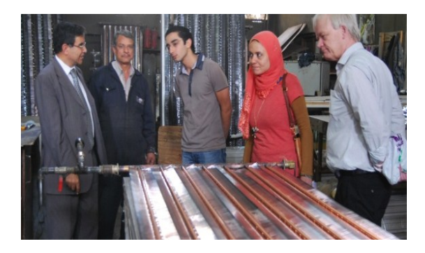
Part III: Walk-through of production site

The interviews were followed by the third step, a walk-through assessment of the production site. Particular attention was put on documentation procedures, like check lists at the workshops.