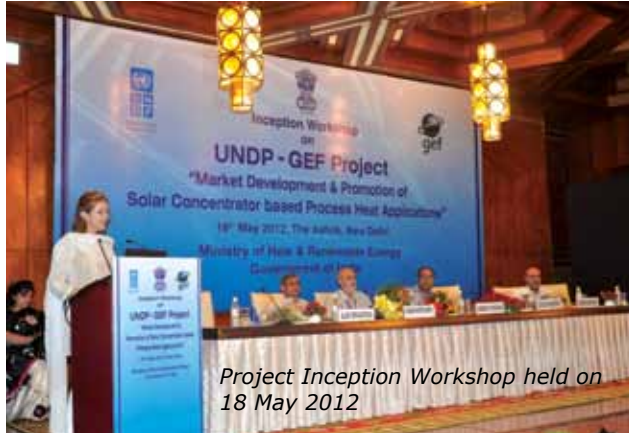
Project Inception Workshop held on 18 May 2012