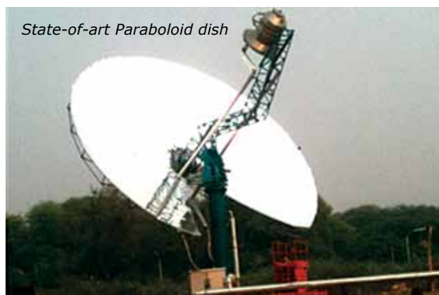
State-of-art Paraboloid dish

site. The dish concentrates the incoming radiation onto a highly efficient cavity receiver, which heats the working fluid upto 400 °C for either direct applications or indirect applications via heat exchangers. The dish is designed to track the sun in two axis automatically to follow the sun without any manual intervention. The system has one of the highest efficiencies and is expected to address most shortfalls of the existing systems.