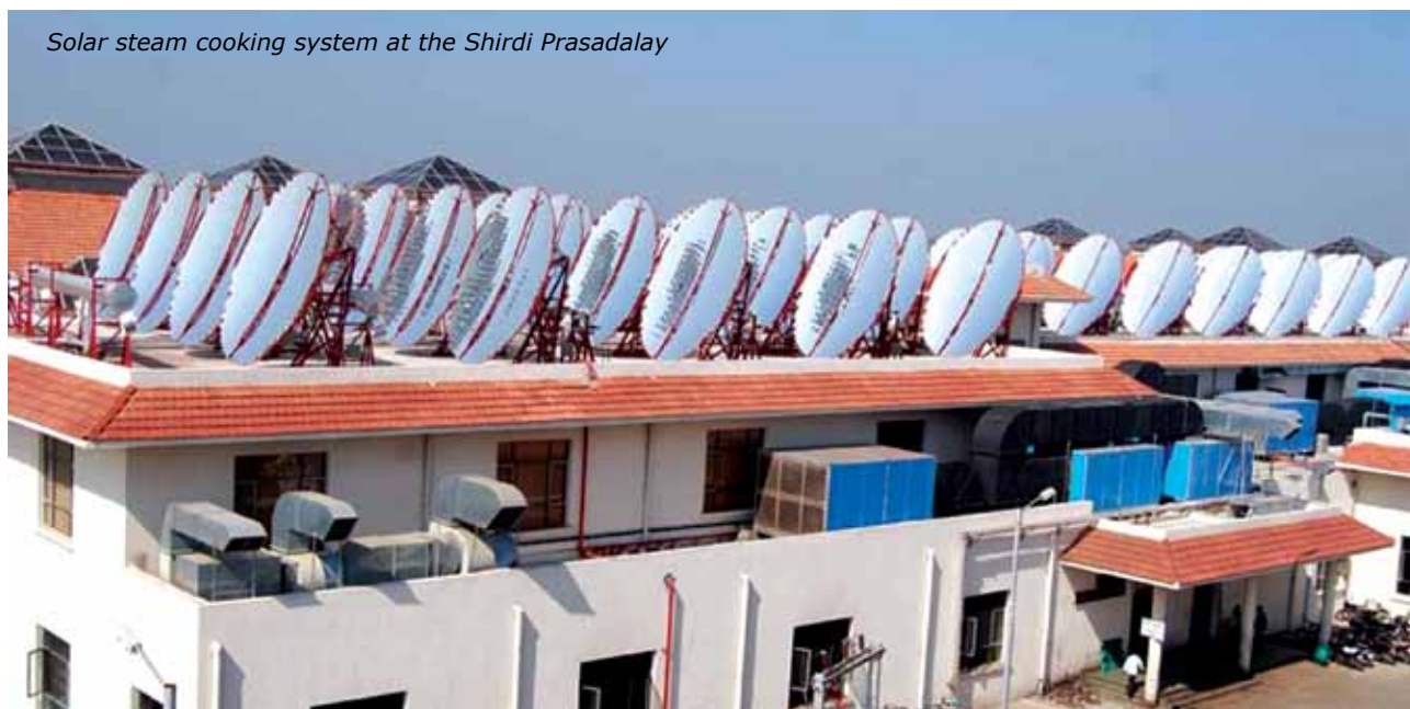
Solar steam cooking system at the Shirdi Prasadalay

Steam cooking is known to be one of the cleanest forms to prepare food, especially when food is being prepared for a large number of people. Not only is steam cooking clean, it is more efficient and hygienic, the only drawback being that steam can only be used to cook items, which require boiling or steaming, such as rice, dal, vegetables, idly, etc. Frying, roasting, and chapatti making is not possible with steam. Cooking with steam, therefore, is popular in southern and eastern states of India—states where rice is eaten more frequently. These installations include religious places/ashrams, schools, students' hostels, canteens, etc. In order to generate steam, boilers are run on diesel, furnace oil, or LPG by these institutions. Steam generated from these boilers is then passed through big vessels containing food items, each being cooked in an hour or less for hundreds and thousands of people.