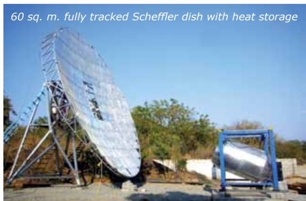
60 sq. m. fully tracked Scheffler dish with heat storage

site. The dish concentrates the incoming radiation onto a highly efficient cavity receiver, which heats the working fluid upto 400 °C for either direct applications or indirect applications via heat exchangers. The dish is designed to track the sun in two axis automatically to follow the sun without any manual intervention. The system has one of the highest efficiencies and is expected to address most shortfalls of the existing systems.