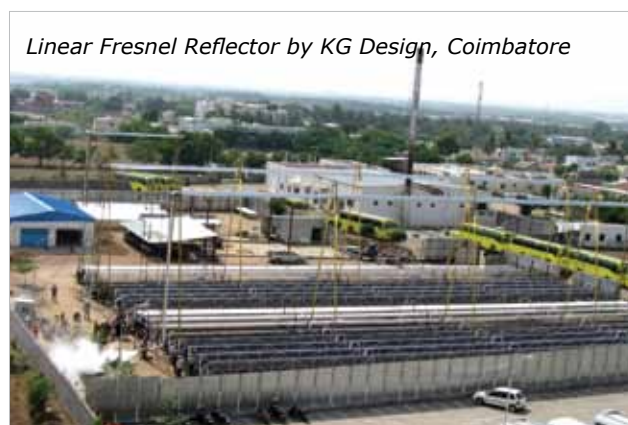
Linear Fresnel Reflector by KG Design, Coimbatore

To avoid manual errors in N-S adjustments of Scheffler dishes for keeping the focus at centre of the receiver, dual axis automatically tracked dishes of 60 sq.m.have been developed by Brahmakumaris at Mount Abu with required storage of heat in a metallic block for use in non-sunshine hours. The heat stored could be utilized for various applications during evenings and nights by sending water to the metallic block, which converts it to steam/hot water.