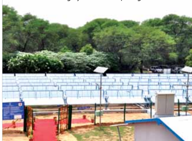
100kw solar cooling system at SEC, Gurgaon

A state-of-the-art paraboloid dish of 90 sq. m. aperture area has also been developed in public-private partnership mode and has been successfully demonstrated at the same