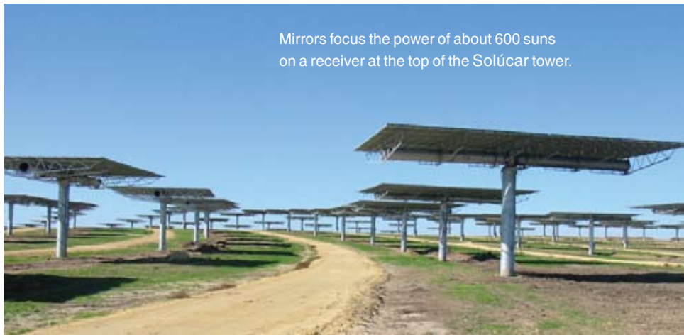
Mirrors focus the power of about 600 suns on a receiver at the top of the Solúcar tower.