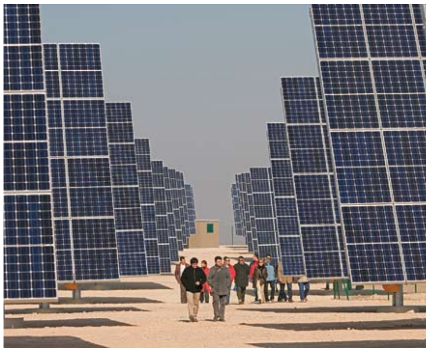
Spanish companies continue to innovate in the technology and marketing of photovoltaic power.

"Electricity costs are going up—and solar thermal costs are going down," says