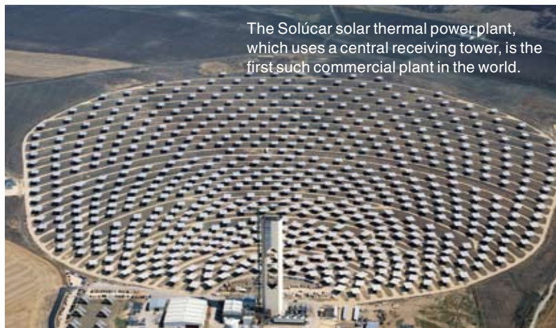
The Solúcar solar thermal power plant, which uses a central receiving tower, is the first such commercial plant in the world.

“ At this plant, we’re working with the potential of about 3,000 suns—so it has to be very well designed and operated to provide the best results.”