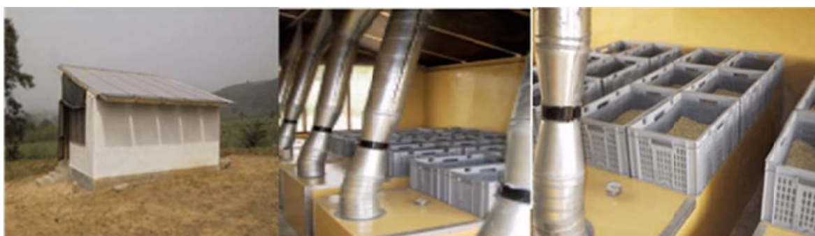
Figure 12: Test solar air collector dryer at Silwood farms-Pokoase

Figure 12 shows one of the large-scale solar dryers that were piloted at Silwood farms. This test solar air collector at Silwood farms is one of the many examples of pilot solar drying systems that have been carried out in the country. This system is located at Pokoase in the greater Accra region.