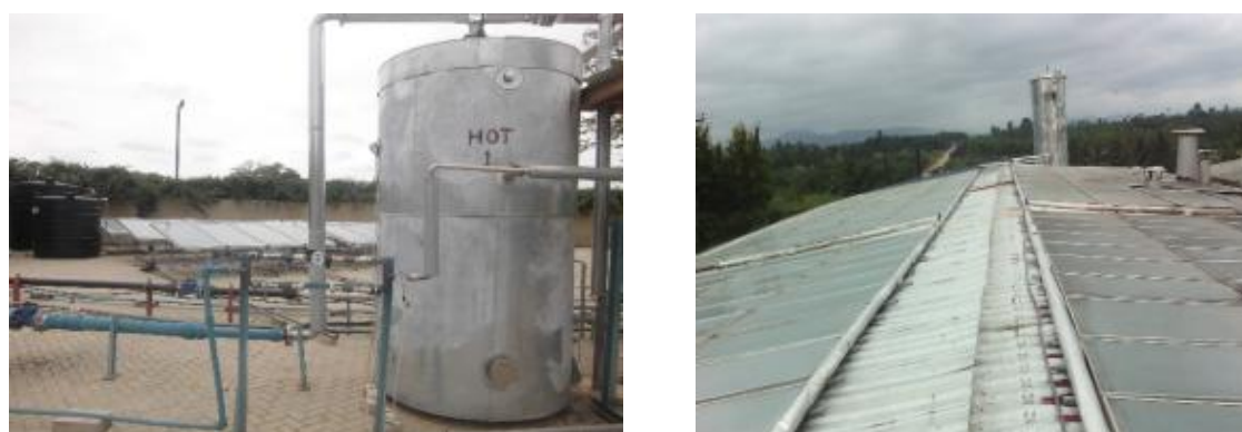
Figure 1: a) Pumped systems with backups at Royal Senchi Resort b) Pumped system with backups at HPW.

In Ghana, there are two main systems in operation, that is, the direct thermosyphon and direct pumped systems. The dominant system is the direct pumped system. However, the configuration and usage are different. For instance, the solar water heating system with an installed capacity of 37.8kW th at the Royal Senchi Resort located at Akosombo, E/R, is used to preheat cold water before entering a boiler to be heated with LPG to the required temperature. In the case of HPW (Fresh and Dry) Company at Adeiso, E/R, the system is used directly to dry the fruits when the temperature attained is sufficient but when the required temperature is not attained, the water from the solar heating system is further heated with diesel and biogas to the expected temperature. Figure 1 depicts the two main systems in operation in the country.