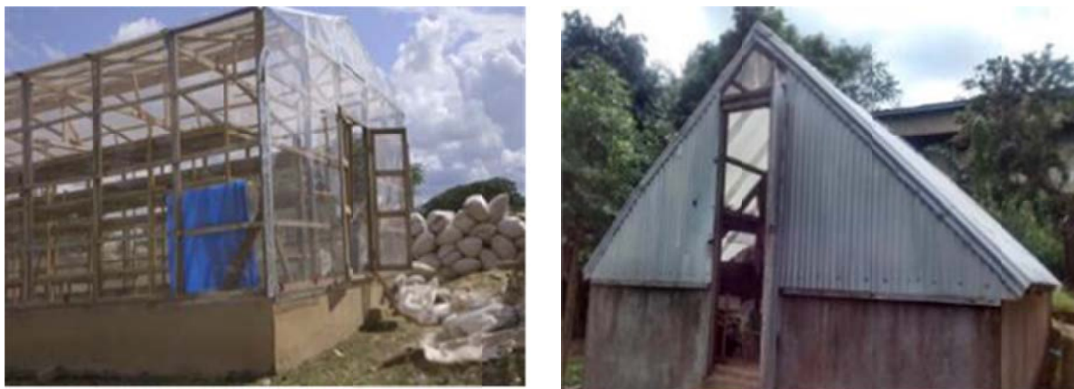
Figure 11: a) Tent type solar dryer at Sekyedumase and b) house solar dryer at Mampong

Figure 10 is a large-scale solar drying system installed for a group of farmers at Alavanyo in the Afram Plains district in the Eastern Region for the drying of maize. Figure 11 a is a large scale solar dryer at Nkoranza in the Brong Ahafo region for drying maize whilst Figure 11 b is also a large solar dryer at Mampong Akuapem in the Eastern Region for drying plant parts.