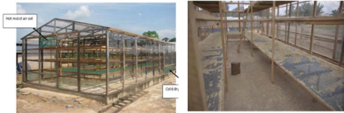
Figure 10: Large scale maize solar dryer by MoFA- inside and outside view

Figure 10 is a large-scale solar drying system installed for a group of farmers at Alavanyo in the Afram Plains district in the Eastern Region for the drying of maize. Figure 11 a is a large scale solar dryer at Nkoranza in the Brong Ahafo region for drying maize whilst Figure 11 b is also a large solar dryer at Mampong Akuapem in the Eastern Region for drying plant parts.