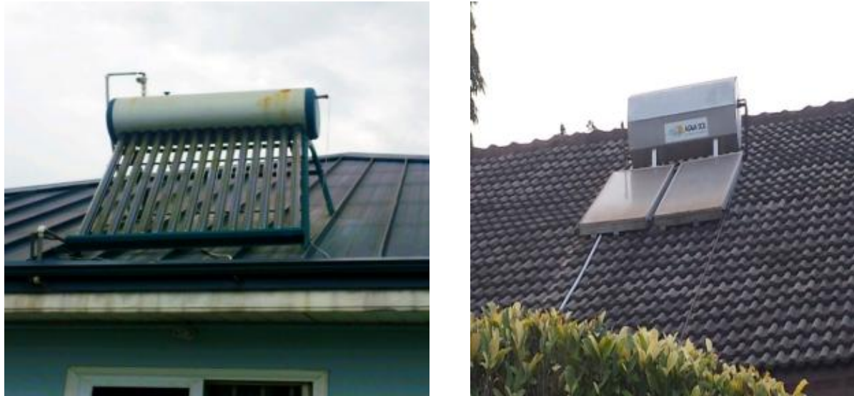
Figure 4: Thermosyphon systems for domestic uses