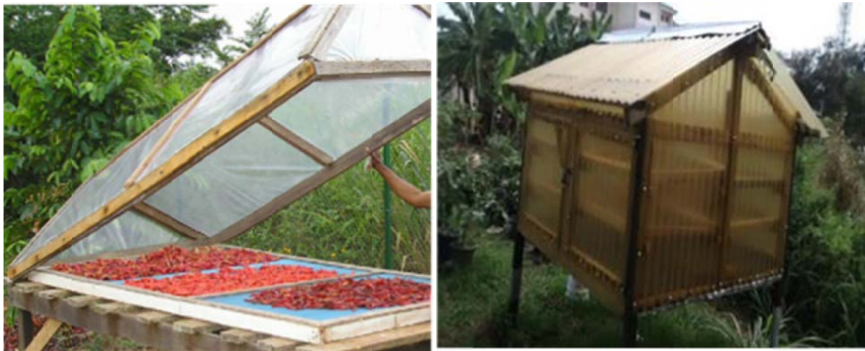
Figure 9: Different solar dryers for smallholder farmers

Individual farmers who can afford small dryers usually use it in their farms and Figure 9 shows the variations in these constructions. Generally most of these farmers use direct solar dryers in their farms.