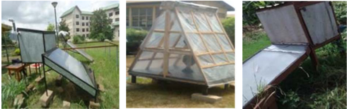
Figure 8: a) Mixed mode solar dryer at Koforidua Polytechnic, b) Direct solar dryer and c) indirect solar dryer

in Figure 8a, b and c. There are pilot hybrid solar drying systems in some research institutions.