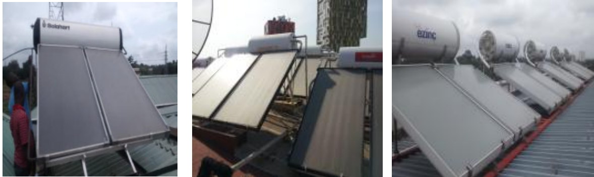
Figure 2: Pumped system with internal heat exchangers a) at Anita Hotel, Ashanti. b) at African Reagent Hotel, Accra. c) at Airport View Hotel.

which is used to increase the temperature of the hot water if the desired temperature is not attained using electricity from the national grid. Apart from the pumped systems with backups, there are other pumped systems in operation without backups such as those installed for domestic purposes.