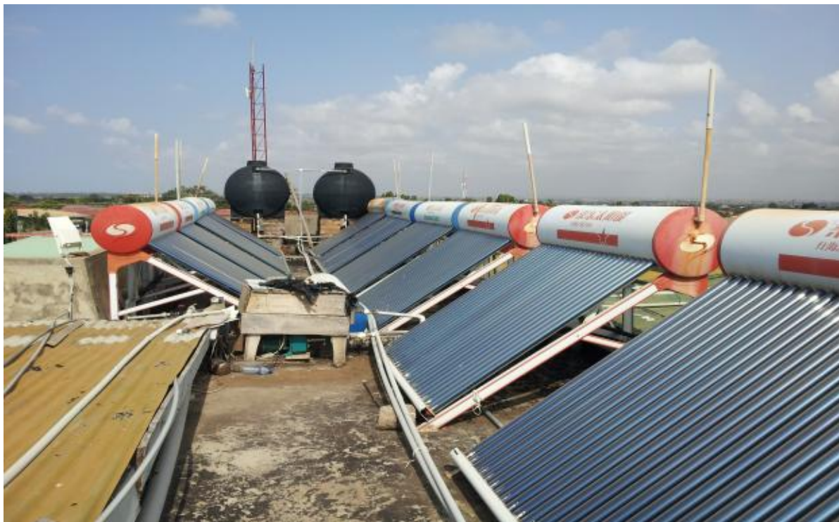
Figure 3: Pumped system with a central backup at Tema International Hotel, Tema.

The other system in operation is the thermosyphon system. Among the sites surveyed, the largest was the 20.7\text{kW}_{\text{th}} system installed at Wynca Sunshine Agric, Boankra in the Ashanti region of Ghana.