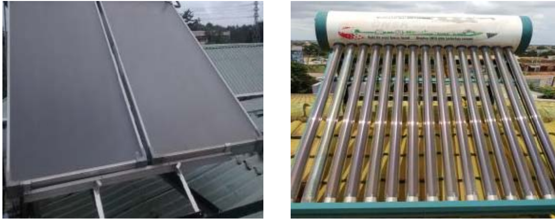
Figure 5: Types of solar collectors used in Ghana a) Flat Plate b) Evacuated tubes